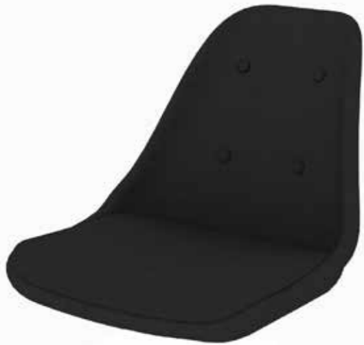
Choose your seat