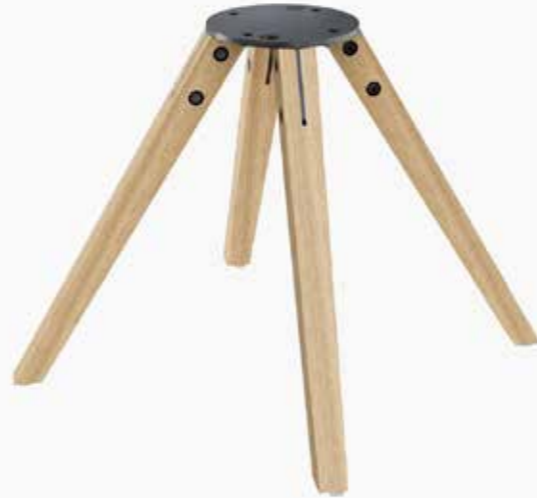
Choose your chair legs